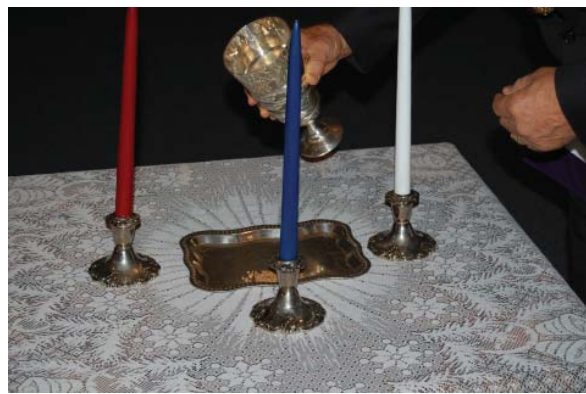
The corn of nourishment, wine of refreshment and the oil of joy