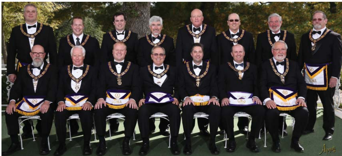
2015-16 Grand Lodge Officers