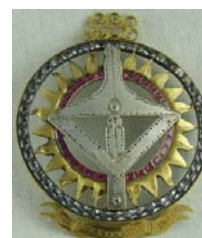
Grand Stewards Jewel