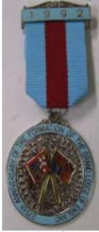
275th Anniversary Jewel

All of these jewels, as well as other Masonic aprons and regalia can be viewed in the collection of the Iowa Masonic Library Masonic Museum. The Grand Lodge of Iowa will be opening a special exhibit entitled "Masonic Treasures of the Iowa Grand Lodge" in June 2017 to help commemorate the 300th anniversary of the Grand Lodge of England.