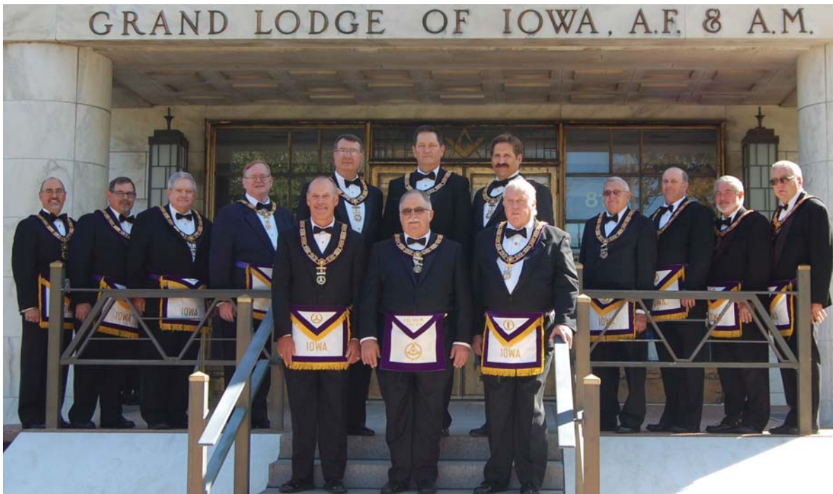
2016-17 Grand Lodge Officers

The Grand Lodge Bulletin is available for download on the Grand Lodge web site http://grandlodgeofiowa.org/