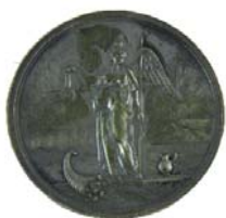
Country Stewards' Medallion

Another early, and rare, jewel that we have in our collection is the Country Stewards' medallion. This medallion was granted to members of Country Stewards' Lodge in November 1789. The obverse has a raised picture of a goddess holding a medallion in her right hand and a staff in her left. Near her are a horn of plenty and a jug of wine. The reverse has the following inscription embossed upon it: "Granted by Grand Lodge in Quarty Commun 25 Nov. 1789 to the members of Country Stewards Lodge." The Country Stewards' Lodge came about as a part of an annual outing of the Grand Lodge of England to migrate to a country resort. This annual outing became known as "The Country Feast." Later, Stewards were appointed annually to organize the entertainment of the Grand Lodge. This group became known as "Country Stewards." These Country Stewards formed a lodge called "The Country Stewards' lodge, similar to the above mentioned Grand Stewards. They also adopted a distinctive dress and a distinctive medal that was worn by members.