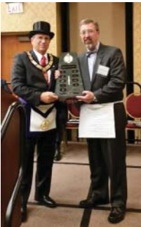
Grand Masters Award