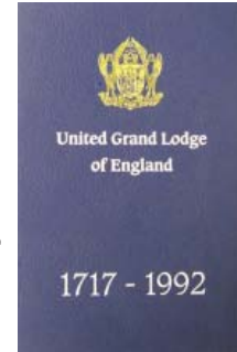
275th Anniversary Booklet