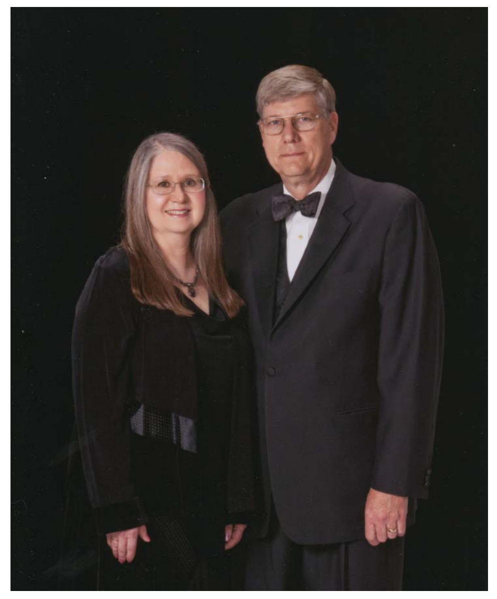
Please join us for the 171st Annual Communication of the Grand Lodge of Iowa at the Sioux City Convention Center.