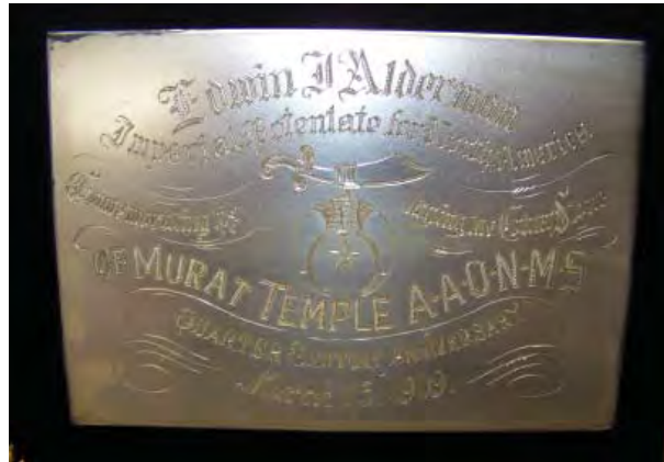
Murat Temple Engraving

It so happens that my first professional job out of graduate school was working at the Indiana State Museum, then located on Alabama Street, near the Indianapolis City Market and Market Square Arena (since torn down). I used to pass this strange looking mosque-like building almost every day to and from work. I remember that it was labeled the Murat Shrine Temple. At that point, I was not involved in Masonry and had no clear understanding of what the building was used for.