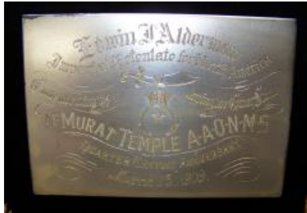
Murat Temple Engraving

It so happens that my first professional job out of graduate school was working at the Indiana State Museum, then located on Alabama Street, near the Indianapolis City Market and Market Square Arena (since torn down). I used to pass this strange looking mosque-like building almost every day to and from work. I remember that it was labeled the Murat Shrine Temple. At that point, I was not involved in Masonry and had no clear understanding of what the building was used for.