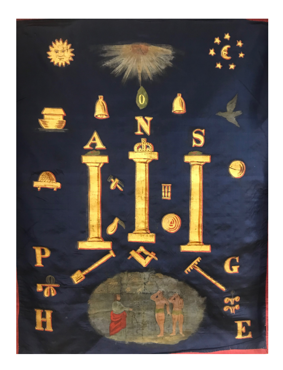
Order of the Free Gardeners

"Celebrate our Past, Embrace our Future"