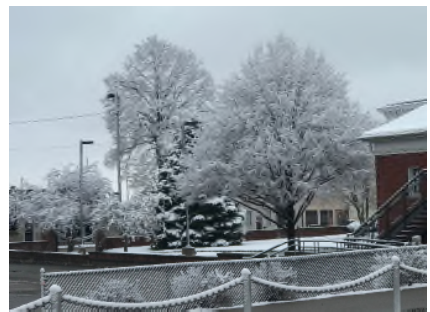
Cedar Rapids Snow in April