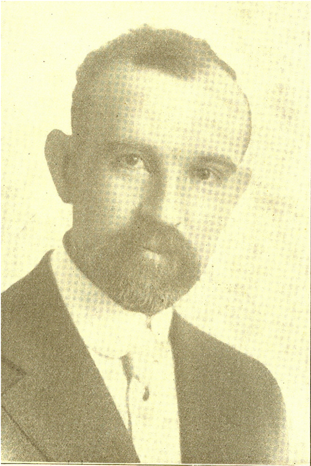
OLIVER DAY STREET