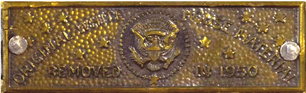
Verbiage of plaque on stones - Original White House Material Removed in 1950