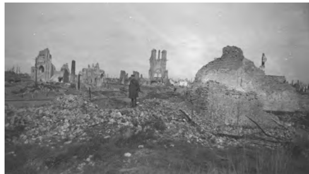
Mack at Ypres, Belgium cloth hall back of him