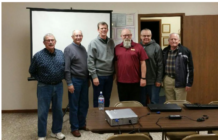
Attendees at the Secretaries Conference in Manilla