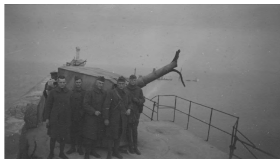
Near the end of the "mole" at Zeebrugge, Belgium