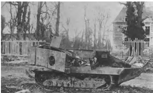
Schneider Tank Grivesnes, France

This is a very nice and complete collection of World War I related post cards and photographs. It makes a fine addition to our overall collection of World War I related materials. The fact that this collection was put together by an Iowa Mason and donated by his family makes it very special.