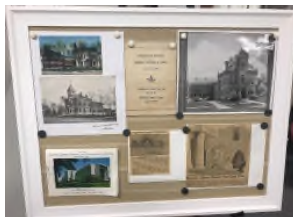
Linn County Genealogy