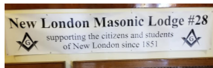
New London Lodge No. 28