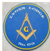
Lyons Lodge No. 93