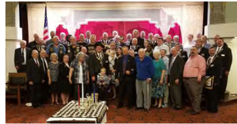
Dubuque No. 3