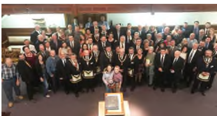
Marion Lodge No. 6