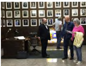
A Night at the Museum