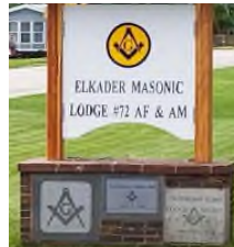
Elkader Lodge No. 72