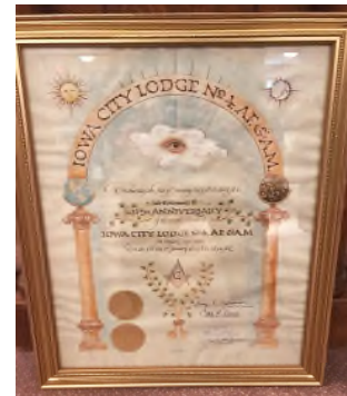
Iowa City Lodge No. 4