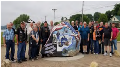
Freedom Rock in Le Claire