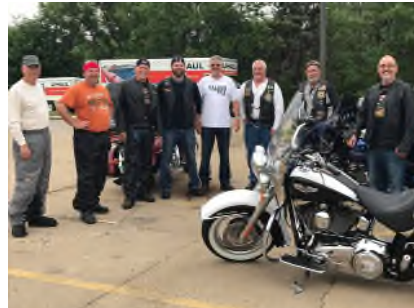
Grand Master's Motorcycle Ride