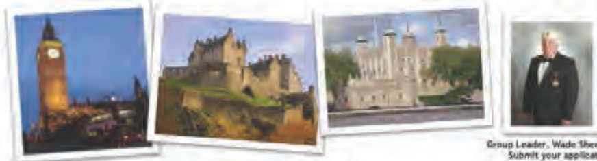
Group Leader, Wade Sheeler Submit your application with the QR Code below.