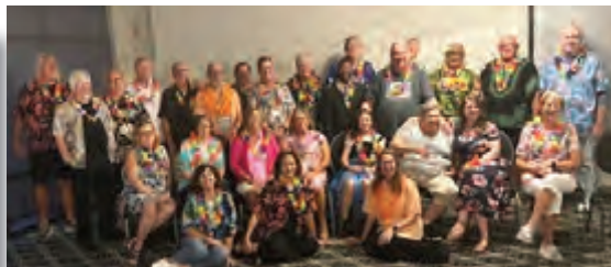
Aloha from the 2023-2024 Grand Lodge Family. We were in the Game!