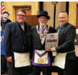
Black Hawk Lodge No. 65 receives the Grand Master Award

The proposed amendment to the Laws for Subordinate Lodges to eliminate mileage and per diem passed. The proposed amendment to raise the initiation fee for the Grand Lodge to $50.00 passed. The proposed amendment to create a charter fee of $100 for each new charter issued passed. The proposed amendment to change the Trustees of the Grand Lodge from three members to five passed. The proposed amendment to change proficiency passed. The proposed resolution to change Anamosa Lodge No. 46 to Anawatha Lodge No. 46 passed. The other proposals were found not in form or withdrawn and were not acted upon.