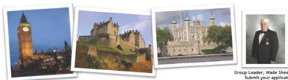
Group Leader, Wade Sheeler Submit your application with the QR Code below.